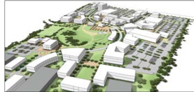
illustrative plan model mexico client : confidential

Through a series of internal, collaborative work sessions, we develop a detailed design package to solicit reaction and encourage suggestions from our clients. Our flexibility and open communication make certain that the vision is respected and the project budget stays on track as we set the stage to produce a comprehensive set of construction documents. As tenants begin to express interest in joining the project, we produce the exhibits and marketing pieces that are crucial to getting leases signed and attracting other prospects.