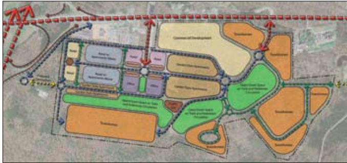
mixed use project northeast united states client : confidential

We understand that, without a practical approach to determining its feasibility, a "vision" is nothing more than just that. Kick-off meetings with our clients establish project goals, programming, and design direction, followed by a due diligence process to ensure that these objectives can be met. Aided by our years of experience in retail and commercial markets, our clients have come to rely on our swift delivery of initial site diagrams and yield studies that provide accurate and valuable information for their pro formas.