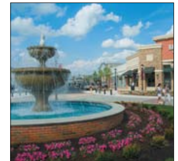
promenade shops at saucun valley lehigh valley, pa client : poag & mcween lifestyle centers, llc