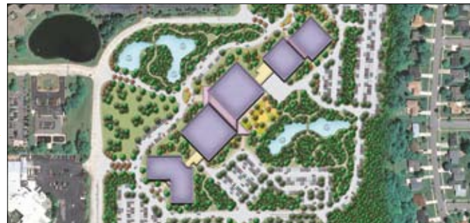
allen-bradley mayfield heights, oh client : rockwell automation corporate campus

A green light sets into motion the entitlements process necessary to bring a project to a community. Investment and buy-in from the public sector requires a sensitive approach that begins with work sessions with municipal staff to establish mutual objectives and common ground. We represent our clients' interests with confidence and sell the benefit of their vision to local ordinances, while clearing hurdles along the way. Our effective illustrative materials and seasoned presentation style assure success with the public sector, even when faced with the most outspoken of citizens.